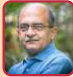
Mr. Prashant Bhushan Senior Advocate Supreme Court of India